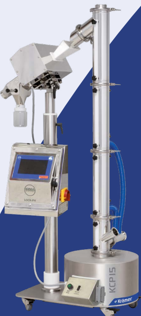
CAPSULE POLISHER METAL DETECTOR