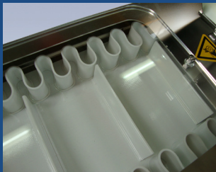
Large inspection window