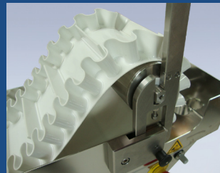
Quick release mechanism