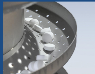
Option: Various helix surfaces available on request