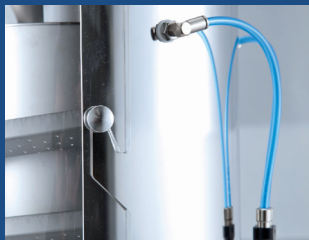
Dust agitation system