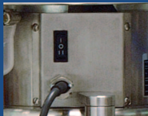
Simple control over dip-switch