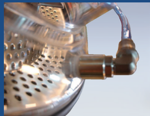
Dust agitation system for optimum dedusting